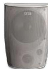
Project 640 WT