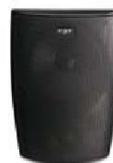
Project 640 BT